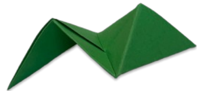
Finished Sonobe unit with foldings